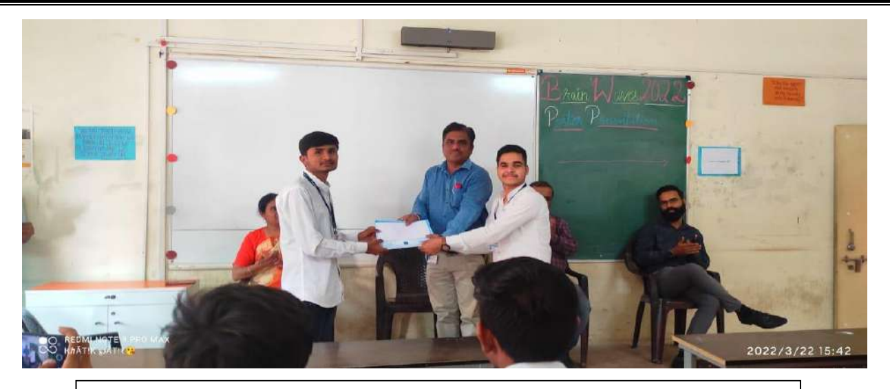
State level Project Competition at GP Ambad