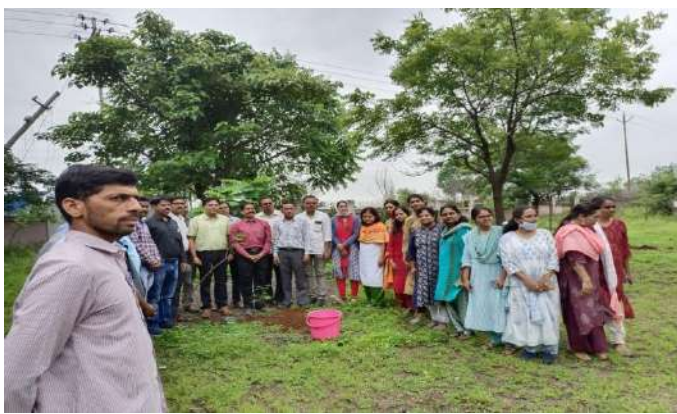
Tree Plantation Program