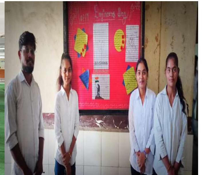
Wall Magazine of Civil Department