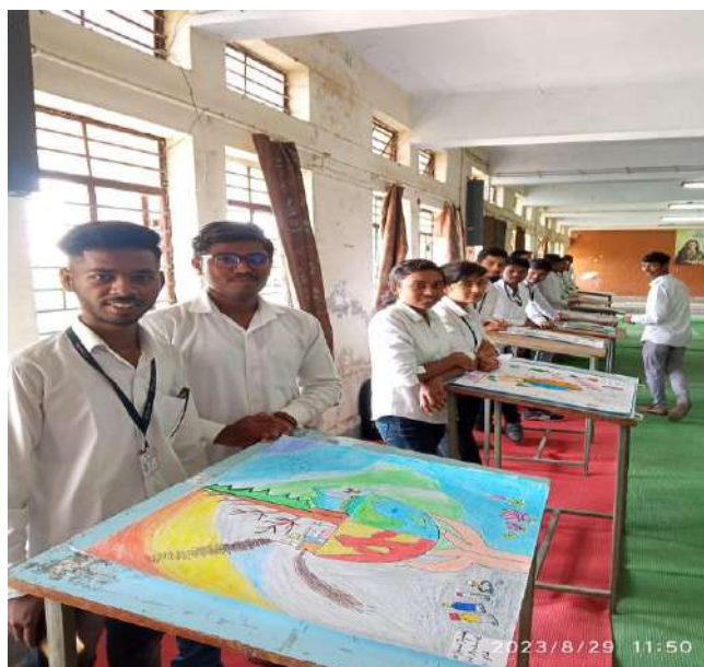
Arranged Poster Presentation Competition