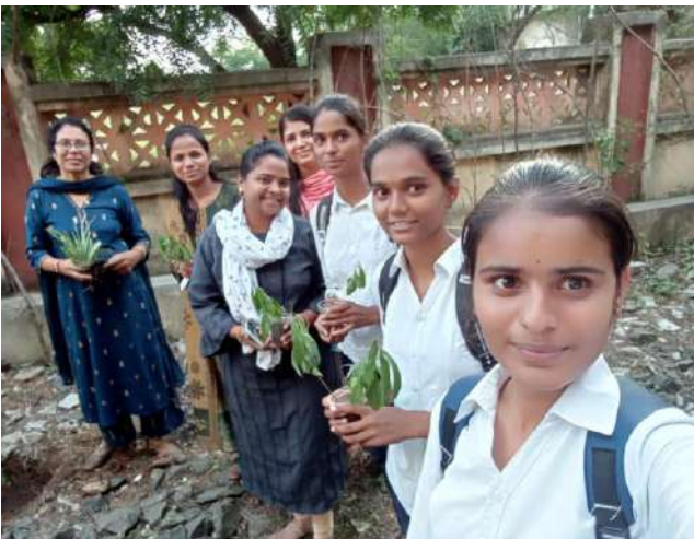
Tree plantation by students and staff