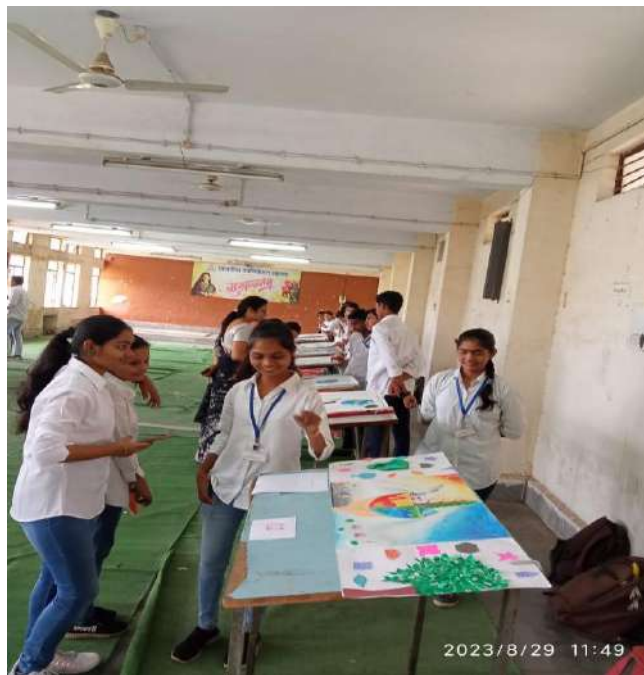
Poster Competition under Meri Mati Mera Desh