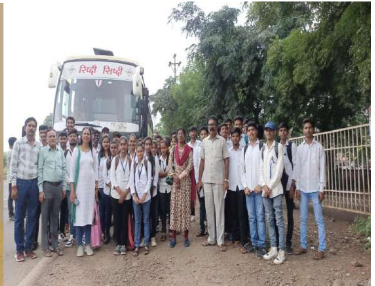
One day tour on “Environmental Studies” by Students and staff.