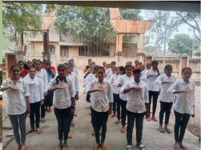
Meri Mati Mera Desh activities