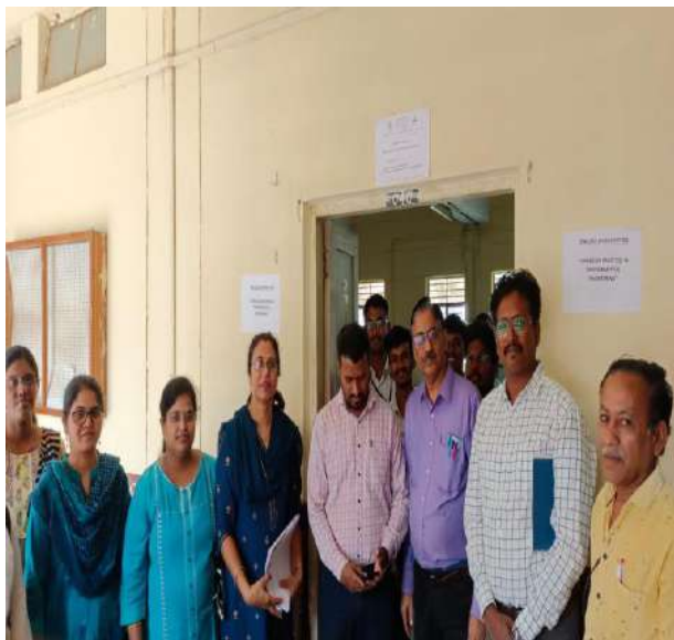
Inaugural function of One day workshop on “Environmental Practices”.