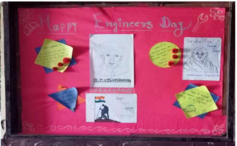
Wall magazine under CESA activity