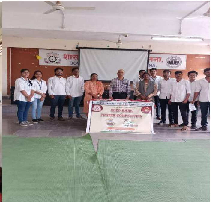
Seed bank collection activity under Meri Mati Mera Desh